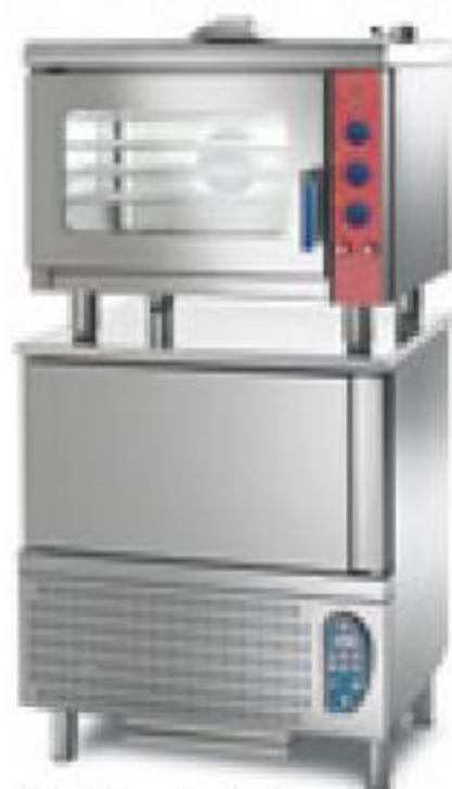
On blast chiller