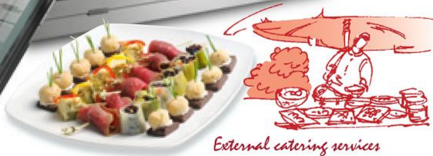
External catering services