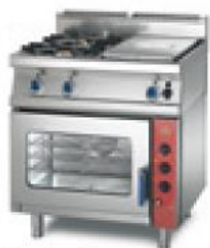
Under 4 burners for series 64/700/900

Easy to install and use, Erremix junior saves time and energy, and guarantees long life and maximum hygiene.