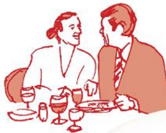
À la carte catering